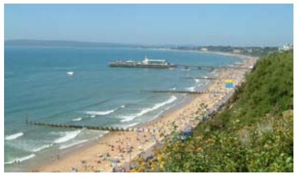
A current day photo of the beach, from a different angle. The pier is still there. In 2007, an opinion survey found the people living here the happiest in Britain.

Tell a friend about the DPCPS. Invite them to a meeting!