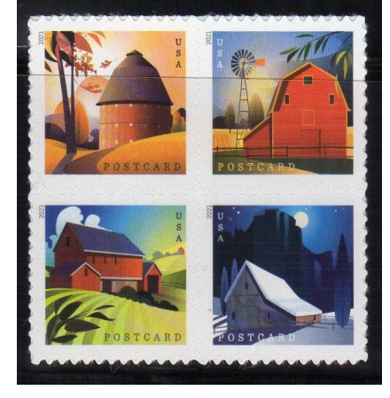
Block of 4 from the sheet format Barns stamp. Voted Best Design for a definitive.

Strip of 4 Message Monster stamps from the 2022 full pane. Voted Worst Design and Least Necessary in the Commemorative category.