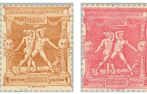
The 1 L. and 2 L. denomination commemorative Greek stamps (Scott #117,118) shown above feature a representation of ancient Greek boxers.

Twelve commemorative Greek stamps were issued during 1896, to mark this historic event. The first four of these stamps are described below.