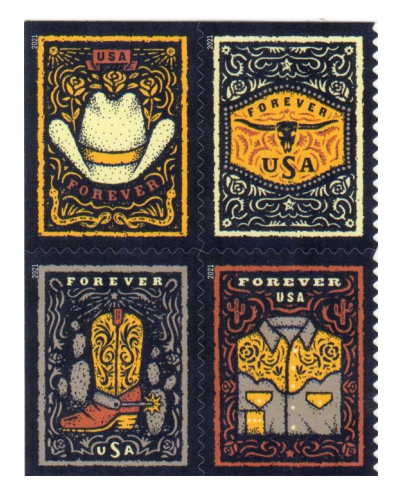
Western Wear definitives block of 4, voted Worst Design

Linn's voters firmly rejected the four Western Wear stamps, placed first in the category.. The stamps were issued to recognize "the enduring legacy of Western wear," the Postal Service said. Illustrated on the stamps are a cowboy boot with spur, a cowboy hat, a Western shirt, and a belt buckle featuring a longhorn head.