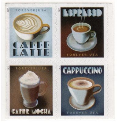
Espresso Drinks definitive. Voted Least Necessary Definitive.

Just two items of postal stationery were issued in 2021: a $7.95 Priority Mail stamped envelope and a nondenominated (36\phi) postal card featuring Dugald Stermer's drawing of a mallard drake that he produced in pencil and watercolor. The stamp imprint on the $7.95 Priority Mail envelope mimics the design of the