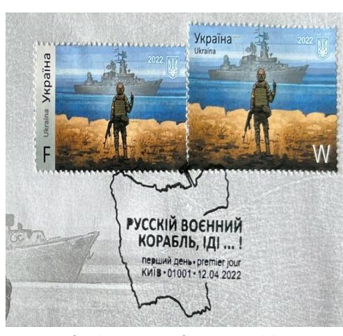
Snippet of a Ukrainian FDC for stamps celebrating the Ukrainian solder response to the Russian demand to surrender.o

On April 12, Ukrposhta, Ukraine's post office issued a pair of stamps celebrating the response of the Ukrainian soldiers on Snake Island to the Russian demand to surrender. The design was selected among entries in a stamp design contest. The winning design was by Boris Groh, and features a Ukrainian soldier flipping off at a passing Russian warship. The two stamps are non-denominated: a domestic rate "F" stamp and an international rate "W" stamp. While the stamps themselves do not contain the words of the Ukrainian response, the first day cancel contains the beginning of the response: "Russian warship, go ... " Attempts to access the Ukrposhta website