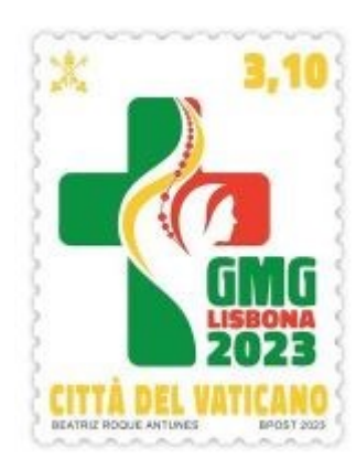
July 6 Vatican City stamp featuring the World Youth Day Logo.

Vatican City issued a new stamp July 6 for the World Youth Day 2023 August 1-6 in Lisbon, Portugal. This stamp replaces a previous commemorative released May 16 for the event and withdrawn two days later.