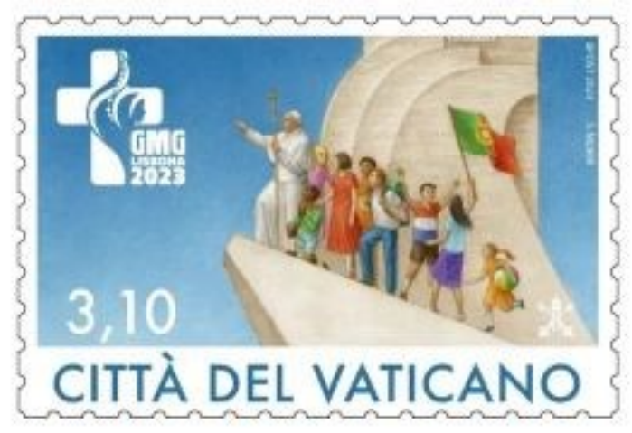
Withdrawn Vatican City stamp for World Youth Day 2023

It aimed to present "a ship that guides young people and the Church towards the future."