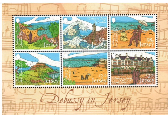
Figure 2. Six singles commemorating Debussy in Jersey with Jersey scenes in a souvenir sheetlet format.

Jersey also issued a set of 6 singles and souvenir sheetlet of these which depicted scenes of Jersey, including a Debussy figure in some of them (see Figure 2, below). The background of the sheetlet contains a fragment of the score for La Mer .