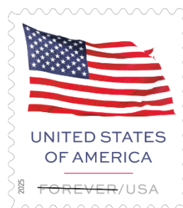
2025 Flag Stamp, to be issued June 7