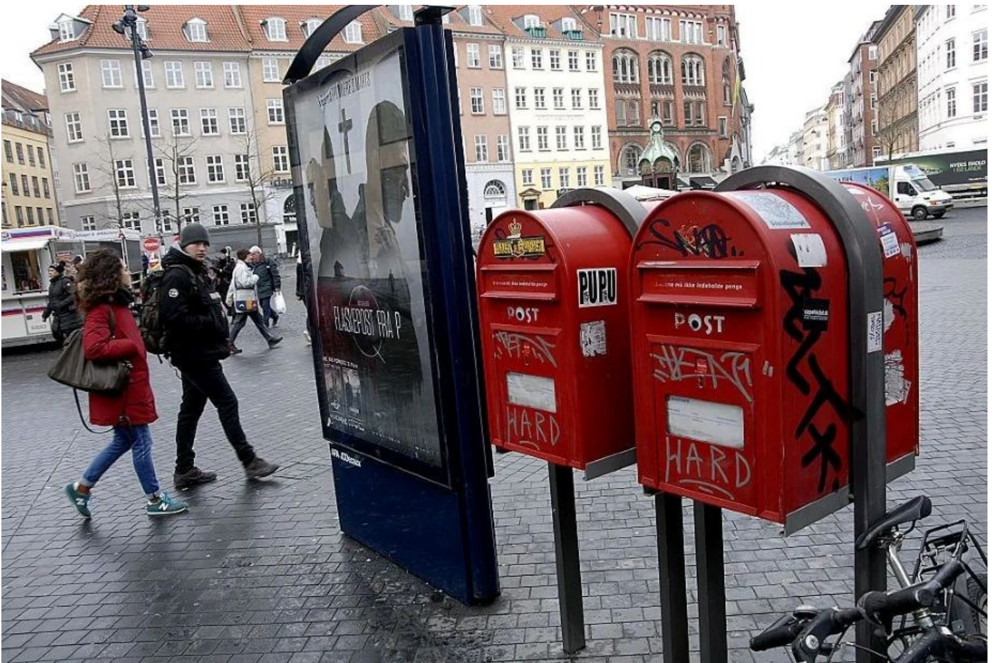
Danish mailboxes, which will be gone by the end of the year.