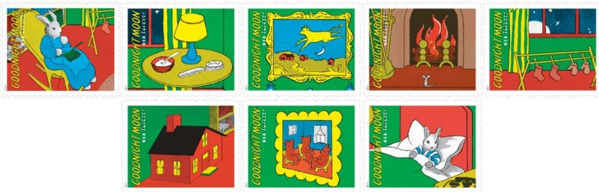
Goodnight Moon Forever Stamps (8) , to be issued May 2