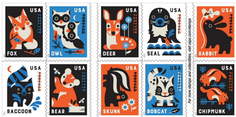
Baby wild animals, to be issued May 23