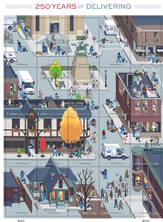
Pane of 20 to be issued in July for 250th anniversary of postal delivery