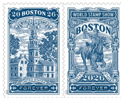
Stamps to promote Boston 2026 philatelic exhibition, to be issued August 14