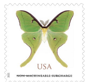
Luna Moth stamp for the nonmachineable 1 oz letter rate