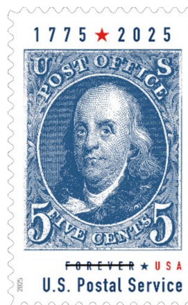
Franklin stamp issued in July for 250th anniversary of postal delivery