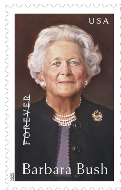
Barbara Bush stamp, to be issued June 10